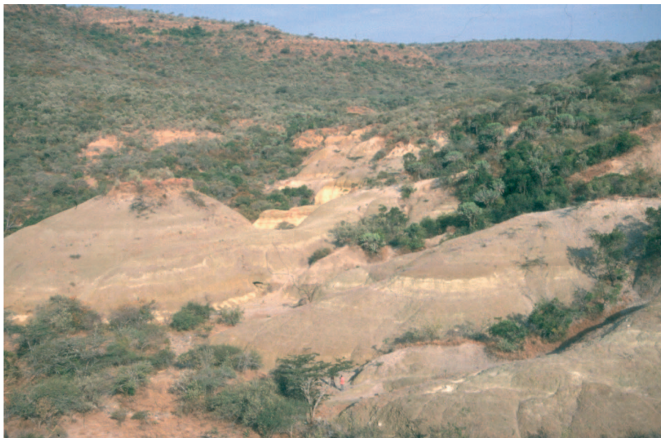
Fig. 3. Photograph of Lemudong'o Locality 1. The view is looking westward. Two people can be seen in the bottom center for scale.

close in age to the Speckled Tuff, indicating rapid sedimentation, and providing support for the correlation of sections between the main localities.