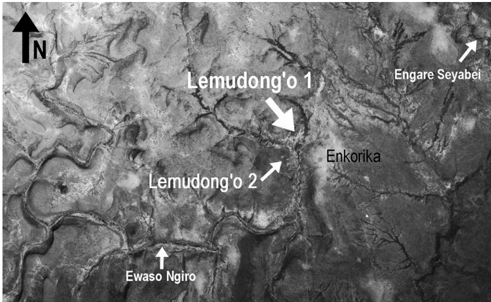
Fig. 2. Aerial photograph of Lemudong'o Gorge. Locality 1 is indicated with the large white arrow. Locality 2 is south of Locality 1 after the two gullies converge on the west side of the stream, marked with the smaller arrow. The eastern bend in the Ewaso Ngiro is easily matched with the line drawing in Fig. 1 for determining scale.

environments. This silt thickens rapidly in the northern exposures, reflecting considerable lateral variation in depositional environments. Lake regression is marked by poorly-sorted greenish brown clayey sands, coarse gritty sands and thin lenses of fine gravels. These coarse sediments contain mostly rolled, but some well-preserved fossils of large vertebrates. Above the clayey sands are dark greenish brown strongly pedal clays with two interbedded yellow-green tuffs and thin sand horizons. The upper tuff, informally named the Speckled Tuff, is fossiliferous, and contains numerous micromammals and seeds. The majority of the fossils derive from this tuff, and from the underlying clays and sands above the yellow silt. Fluvial depositional environments of increasing energy predominate in the upper half of the sequence. These coarse sands are occasionally cross-bedded, fining downward into clayey sands, and show considerable lateral variation. Brown/gray ignimbrite unconformably overlies the sandstones.